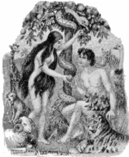
Judiskt bokmärke från 1909

In the Garden of Eden, Satan obtained the title deed to the earth through the fall of Adam. One day it will be given back to us, when Jesus returns.