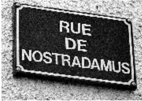
A street named for Nostradamus in Salon de Provence, France.

Mr. N. told Catherine de’ Medici “all of her children would be kings.” 68 However, one died as a child; thus his inaccuracy and error is historically documented for all to see. This, according to the Bible (Deut. 18:22), removes any credibility of divine inspiration as the source of his prophecy.