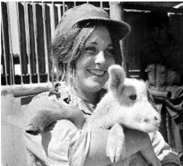
An Israeli soldier hugs her lamb.

Original sin, which is denounced by modern Judaism, was once a chief tenet of ancient Judaism in keeping with the Bible. It is only because some modernists do not want an evident reason to show our need for a suffering Messiah to die for the sins of the world, that the whole idea of “original sin” is denied. Here is the proof: